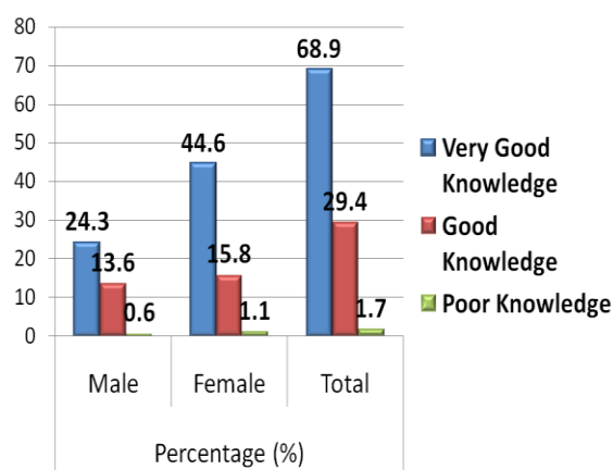
Figure 1. Frequency distribution of knowledge towards psychological guidance and counselling

Students' overall knowledge level towards psychological guidance and counselling were at a higher level. Mean Knowledge level was 78.4 (n = 177). Distribution of knowledge levels among male and female undergraduates are given in Table 3.