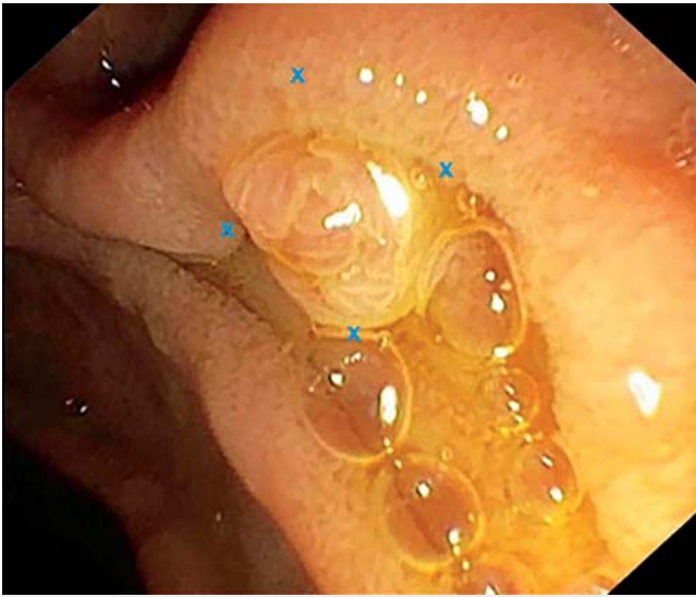
► Fig. 1 Image of major papilla with the points of Botox injection marked as "x."

Botox was that a deeper injection could potentially deliver Botox into the retroperitoneum due to the thin nature of the duodenal wall and to allow Botox to be delivered around the major papilla. Post-procedure, patients were monitored in the endoscopy department for 3 hours. Intravenous fluids or rectal nonsteroidal anti-inflammatory drugs were not administered.