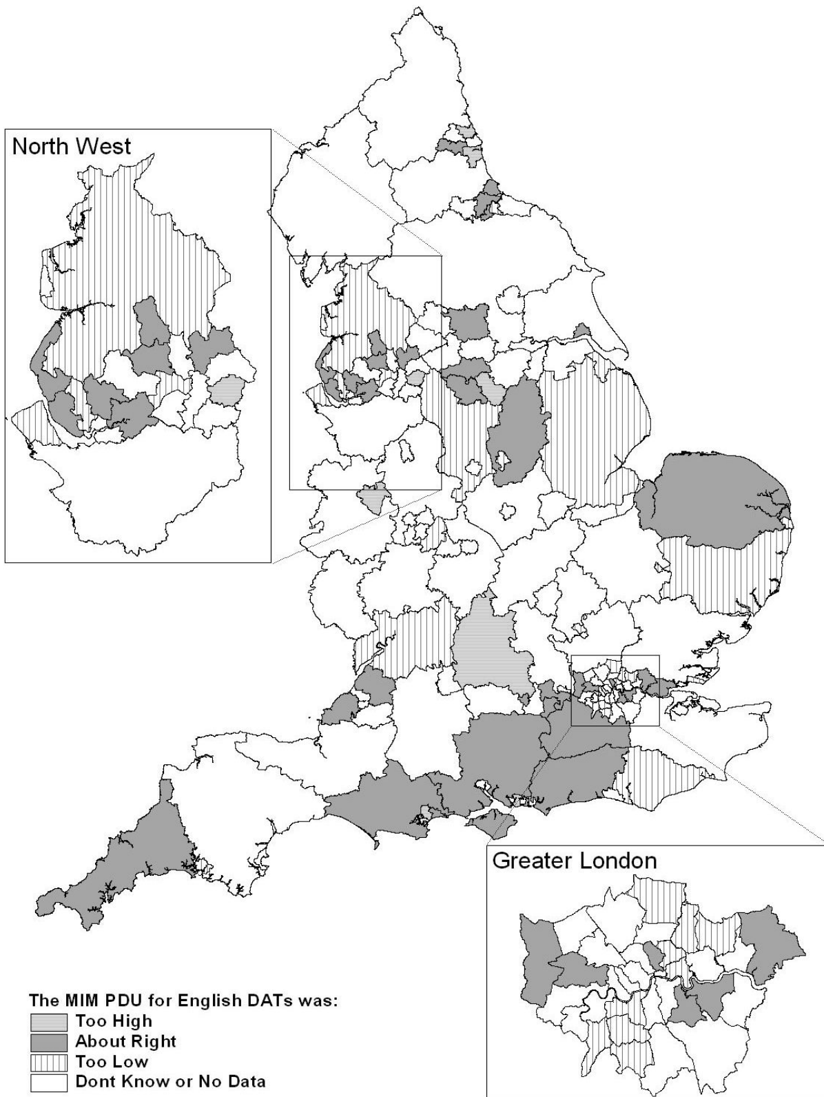
Figure 1 Drug Action Teams' perception of the Multiple Indicator Method (MIM) estimate of problematic drug use (PDU).